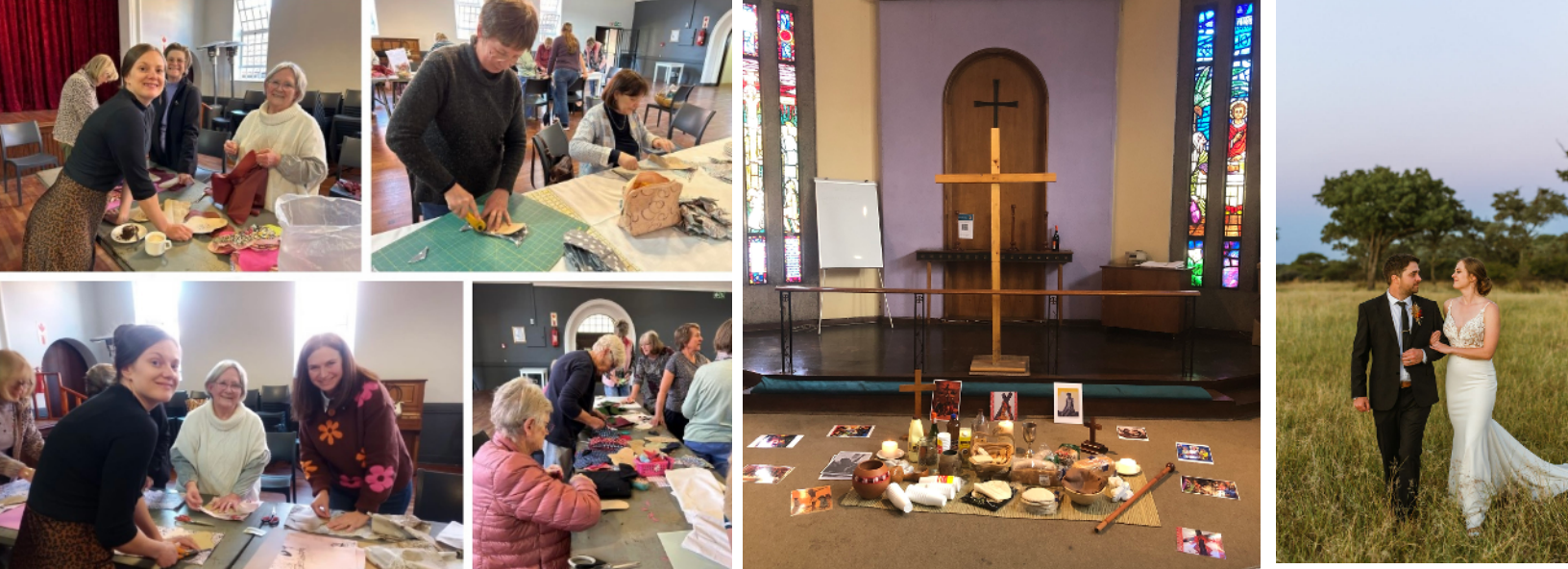
Left: Photo captions go here, they are important! Right: another thing to write about, Bottom: another interesting thing.