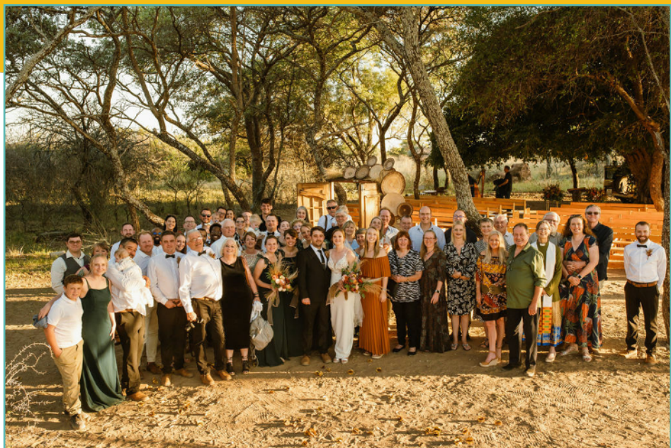
Family and friends flew across South Africa, Scotland, Canada, and the USA to celebrate our wedding at Monate Game Lodge on 24 April 2024 under an ancient fig tree.

2024 has been a year of new beginnings in moving, ministry, and marriage in South Africa. And with new beginnings come new ways of understanding ministry in another context. Recently, I was interviewed by Princeton Theological Seminary on the formative impact that the course "Towards Understanding Other Cultures" has on preparing for ministry life. While I laughed that the course title is also a good summary for cross-cultural marriage, we have learned to always work at "towards understanding." My ministry experiences in South Africa can also be summed as spiritual exercises in learning the art of humility. There is so much listening and learning required to effectively engage a context different than our own. New contexts (like a new marriages) are where we learn there's lots to uncover underneath the surface