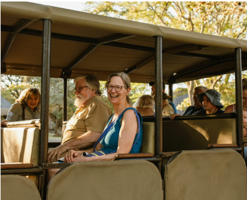
It's not hard to be happy while crawling into a game drive vehicle because the promise of spotting a giraffe, cape buffalo, or lion will await you!