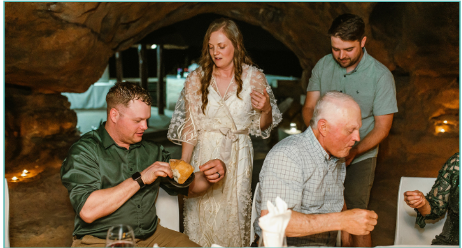
Celebrating communion with our wedding guests at the cave rehearsal dinner.

...It was said among the nations, "The Lord has done great things for them." The Lord has done great things for us, and we are filled with joy. - Psalm 126:1-3